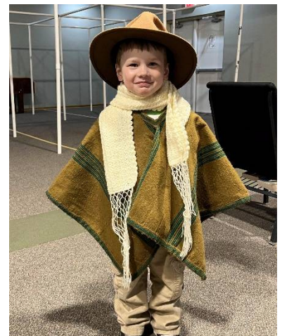
At Kid's Club

Wisconsin! As we write this, we are finishing up our time in Wisconsin with three supporting churches who have encouraged us and faithfully supported us over the past 40+ years. They started off as just