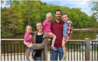
E & J* M, J, C *Names withheld for security purposes