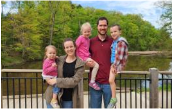
E & J* M, J, C *Names withheld for security purposes