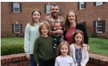
B & J* M, O, P, P, G *Names withheld for security purposes