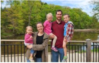
E & J* M, J, C *Names withheld for security purposes